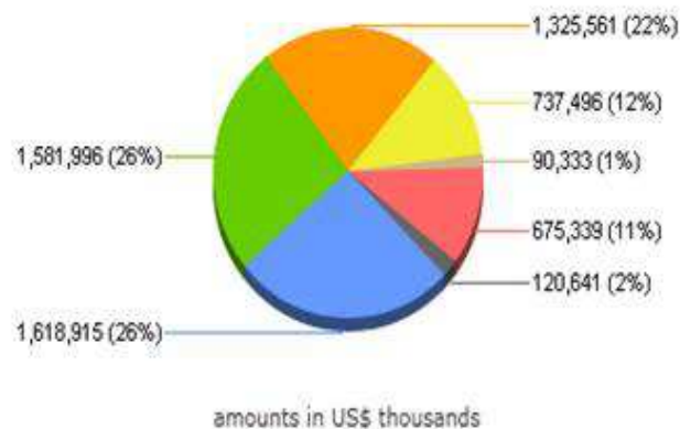
By 2011 programme budget